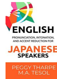
Table 2. The Comparison of a Main Book