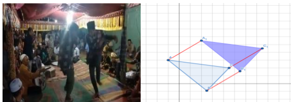
Figure 4. Translation in Ambe-ambeken dance and its geometric transformation

In simple terms, translation can be interpreted as a shift or displacement, but in principle the intended shift is the movement of objects from one point to another in the geometric plane based on the same distance and direction.