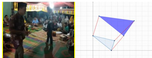
Figure 7. Dilation in the Ambe-ambeken dance and its geometric transformation

dilation scale factor, the following is an illustration.