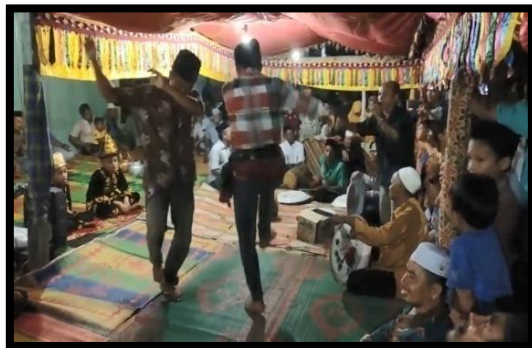
Figure 1. Ambe-Ambeken Dance in Singkil

As an ethnic group, the Singkil people have various traditional arts that are part of their culture. One of them is the Ambe-ambeken dance, also known as the Sakhindayong dance. The Ambe-Ambeken dance is a traditional dance performed by men at certain moments, such as; wedding celebrations, circumcisions, and more. In Singkil language, Ambe-Ambeken can be interpreted by waving. This dance is named that way, because movement variety is dominated by the waving of the dancers' hands. Sometimes this movement also looks like someone rowing a small canoe or bungki , which is used as the main means of transportation by the Singkil Tribe community, especially those who still live in the Singkil watershed. Because the movement is similar to rowing, people in different villages call it the Sakhindayong dance.