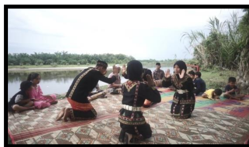
Figure 3. Mekbesalam or closing greetings with mutual respect

The dance movements in this imaginary circle describe the dynamics in human life; there is conflict, competition, and cooperation in it. Then, the verses that are sung emphasize that the life that someone lives must be based on goodness so that life becomes more meaningful and valuable for others.