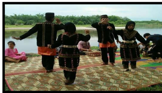
Figure 2. Modified Ambe-ambeken Dance

In its development, this dance then changed slowly, including modifications to a more subtle range of motion and the involvement of women in dance formations (Interview with Muadz Vohry, 65 years). In this modified version, the variety of movements in the dance becomes smoother and is oriented towards the introduction of two young people who are forming a bond of friendship.