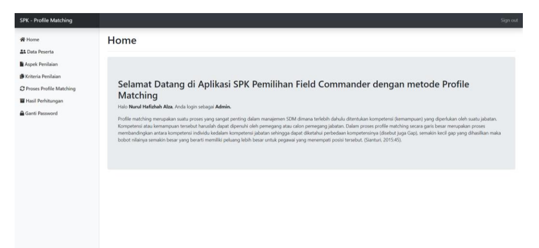
Figure 4. Home Page