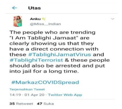
Data 9 . This statement demonstrates how this account address Muslim with Corona virus and demand to arrest Muslims into jail.

Furthermore, the second twitter account spreading the accusating that Muslims were spreaders of Corona virus posted a statement demanding the Indian government to arrest Muslims, particularly to those who are part of the Jamaat Tablighi or support that organization: