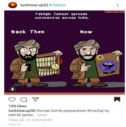
Data 7 : A meme that compares Muslim back then as a terrorist and currently turn to be Corona distributor

The use of social media as an instrument to stigmatize the Muslim community as the distributor of the Corona has been systematically carried out by the Indian online buzzers. they continue to spread negative content and objectify Muslims with stigmatizing terms. If Muslim community, in the past, used to be addressed as a terrorist, in India nowadays, Muslims are identic with Corona virus. This case could be viewed in the bellow data: