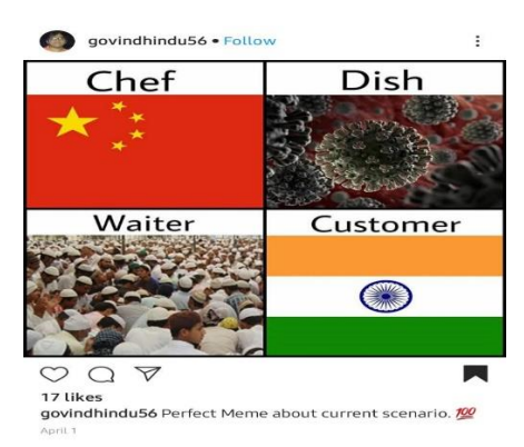
Data 6 . a meme posted by govidhindu56 that amplify how Corona virus infects Indian society.

From the picture, we can see that the Chinese are objectified as a chef who cooked the Corona virus as a cuisine. The Muslim community are perceived as waiters, who are serving the Corona virus for Indians. This meme was liked by 17 netizens in April 1, 2020.