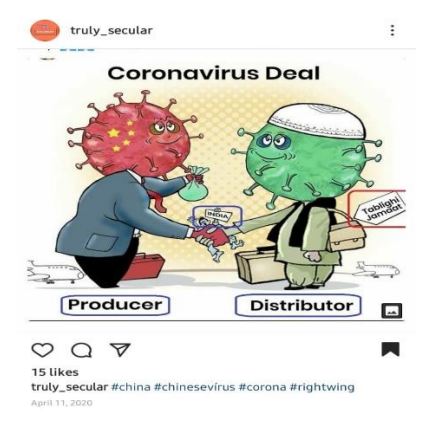
Data 5 . A meme posted by truly_secular that describe Muslim as the spreader of Corona virus

The above picture demonstrates how the Muslim community are accused as the disseminator of Covid-19, whereas the Indian people are perceived as the victims of it. This post is extremely tendentious and baseless because the virus itself can infect anybody without seeing the religion, race, and country. This poster has been liked by 15 netizens in April, 11, 2020.