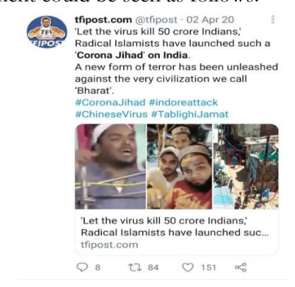
Data 8. This twitter account shows how sensitive this statement to Muslim community.

As for the first account, it states that the Muslim community should be assassinated by the Corona virus itself due to their activity of infecting people with the disease. This racist statement could be seen as follows: