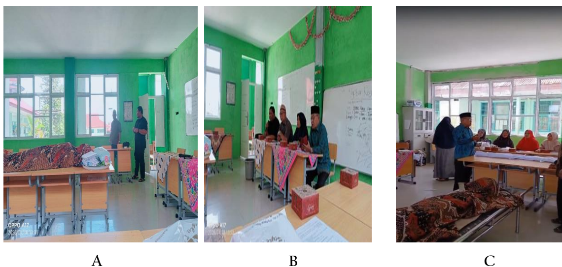
Table 2. Workshop on Funeral Arrangements

Conducting a funeral is a religious practice that requires skill and is performed repeatedly over an indefinite period of time. To carry out this activity, in addition to mastering the requirements and essential elements and memorizing the texts related to all procedures and rituals, a person who will conduct a funeral must already be familiar with the flow and sequence of the funeral proceedings. The following table outlines the procedures for conducting a funeral according to its various stages.