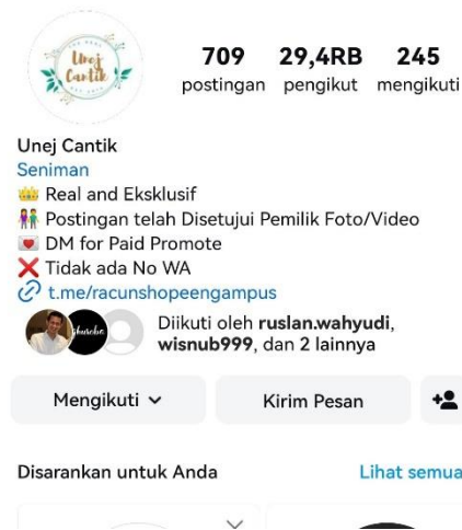
Figure 1. “Unej Cantik” Instagram Account Profile

To date, Unej Cantik has uploaded approximately 709 photos and has garnered over 29.4 thousand followers. Its follower base consists of University of Jember students and the general public, both women and men. The account's popularity stems not only from social interactions but also from the image it has cultivated as a representation of the beautiful female students on campus.