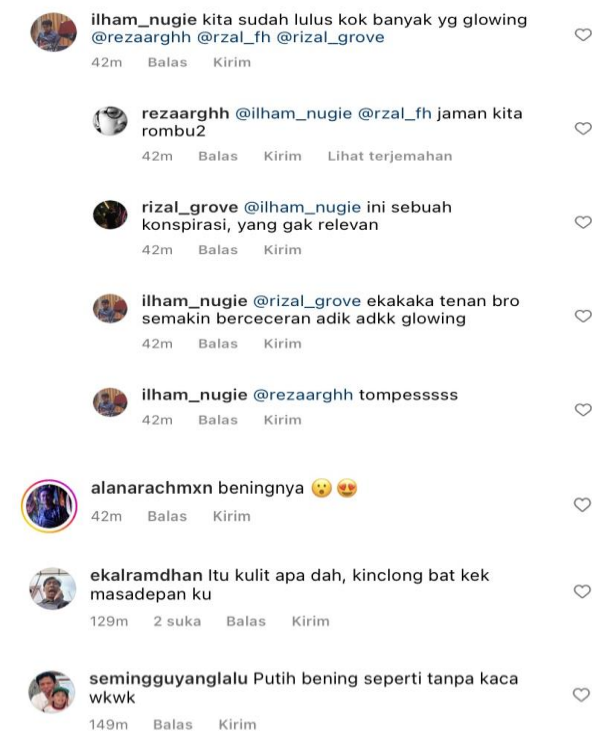
Figure 3. Netizen Comments

economic, and media influences. The preference for fair skin has deep historical roots, often shaped by colonial history and social stratification. In many cultures, lighter skin has been associated with higher social status, purity, and beauty. This tradition has been perpetuated through cultural practices, mass media, and beauty product advertisements, which frequently highlight fair skin as the ideal standard.