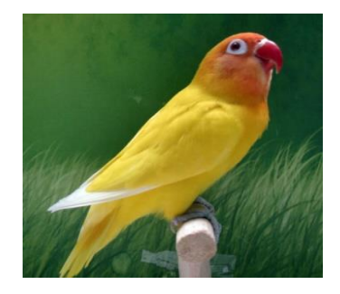
Figure 2 Bird

The second cycle was changed to be completed within 1 week. Based on the results of reflection and assessment of the implementation of the movement in the first cycle, it was found that there was no longer the desired growth in learning achievement, because of the three indicators set, only indicators number 1 and 2 were successful (being able to pronounce vowels and consonants). Therefore, the researcher with the guidance of fellow instructors and the principal as well as various considerations, the researcher again repeated copying acquiring knowledge of Indonesian language fabrics (beginning reading) with signs of being able to learn syllables and words with correct pronunciation. The teacher shows the picture media, after which the students pronounce the letters. After the students finish saying the letters, the teacher asks the students to look at the syllables.