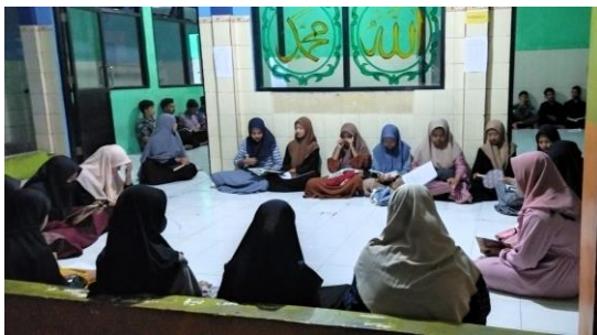
Figure 2. Mabit Activities (Night of Bina Iman and Taqwa)

Tahfidz Al-Qur'an, Mabit (Malam Bina Iman dan Taqwa), Diniyah, Tata Boga, and Multimedia. At 09.00-10.00, Tahfidz Al-Qur'an is carried out with the guidance of each Qur'an Tahfidz teacher. The worship control book masters Tadarus Al-Qur'an. Online learning at 10.00-12.00; Dhubur, Asr, Maghrib, Isya', dawn prayers are controlled by the class teacher through the worship control book. Remember that the school applies Diniyah learning after learning. Diniyah is held on Wednesday and Thursday alternately with material on the science of hadith and jurisprudence. Every Friday, the school makes it a habit to read QS. Al-Kahfi jointly and lead through class audio at 07.00-07.30" 25 . Habituation is one of the value-building approach techniques to get used to positive things so that habituation becomes a habit.