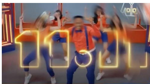
Figure 1. Marketplace

The example above is one of the marketplace ads. The discrepancy in advertising ethics that occurs is for advertising stars or endorsers to wear clothes that show auras. In the Islamic view, all limbs except the hands and face are members of the female aurat, and from the navel to the knees, they are members of the male aurat. And in principle, the aurat should not be shown, because showing the aurat will have a bad effect on him as well as on others. 8