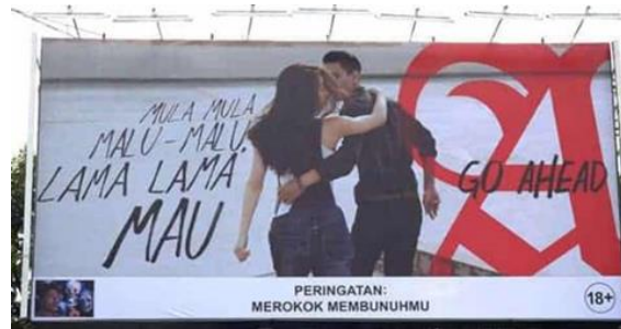
Figure 2. Cigarette

The picture above is one of the cigarette advertisements. Ethical discrepancies that occur are inappropriate, vulgar, or offensive language and images displayed in public spaces. This harms the moral and ethical values of Islam because Islam strictly forbids people who are not muhrim to do things related to shahwat. The martyr turns from truth to immorality, which eventually leads to wickedness and incarceration. 10