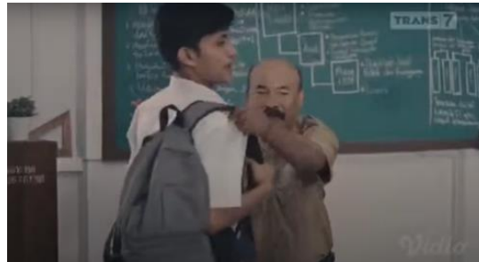
Figure 6. Snack ads

The example above is an advertisement for games, streaming, chatting applications, and others. The 30-second ad tells the states of learning in class, where two people are late for class with unfair punishment. One person is in law, and the other is not punished; the child is respected because the teacher and child often play games together. This was opposed by many, as the advertisement was considered discriminatory and harassing to a teacher. So in advertising ethics, one must also be smart in choosing ideas so that there is no misunderstanding and it does not harm any party.