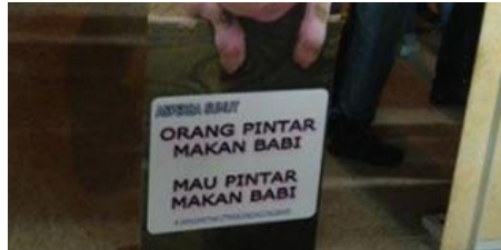
Figure 4. Slogan

The hadith explains that a person is called a believer in Allah (SWT) on the last day when he speaks good words or is silent. Similarly, it happens to speech or word selection in a brand or slogan that should use good words.