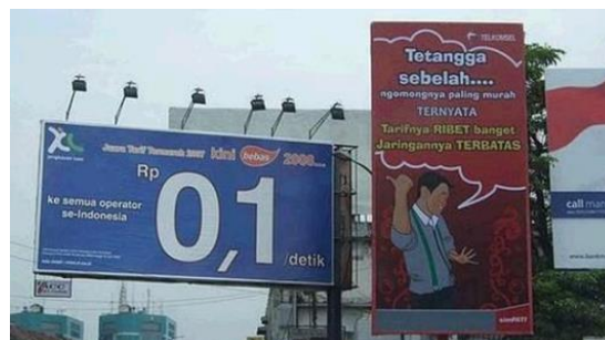
Figure 7. Prepaid Card

The example above is an advertisement for games, streaming, chatting applications, and others. The 30-second ad tells the states of learning in class, where two people are late for class with unfair punishment. One person is in law, and the other is not punished; the child is respected because the teacher and child often play games together. This was opposed by many, as the advertisement was considered discriminatory and harassing to a teacher. So in advertising ethics, one must also be smart in choosing ideas so that there is no misunderstanding and it does not harm any party.