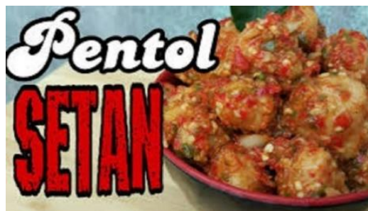
Figure 3. Pentol

The example above is a food advertisement, namely pentol. The discrepancy in advertising ethics that occurs is due to using brand names and slogans that are not good. Something that contains supernatural elements should not be used as a food brand name, because the use of the word is considered inappropriate and like playing with the unseen. The names of food products that contain the names of monks, such as devil noodles, es pocong, kuntilanak chicken, and others, cannot be certified halal by the Indonesian Ulama Council (MUI) 12 .