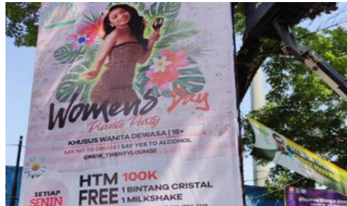
Figure 8. Free invitation

The above advertisements violate advertising ethics according to Islamic law. The ad is a special invitation advertisement for adult women to binge drink. There can be no promotion for a crime.