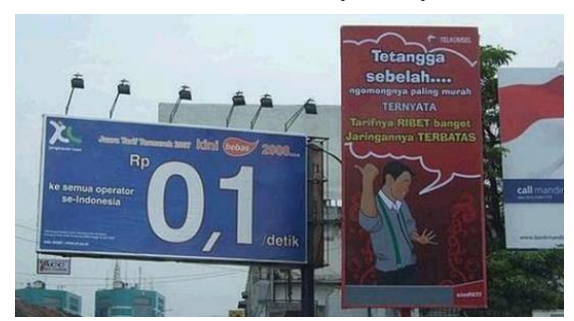
Figure 7. Prepaid Card

The example above is an advertisement for games, streaming, chatting applications, and others. The 30—second ad tells the states of learning in class, where two people are late for class with unfair punishment. One person is in law, and the other is not punished; the child is respected because the teacher and child often play games together. This was opposed by many, as the advertisement was considered discriminatory and harassing to a teacher. So in advertising ethics, one must also be smart in choosing ideas so that there is no misunderstanding and it does not harm any party.