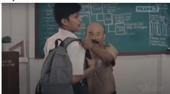
Figure 6. Snack ads

The example above is an advertisement for games, streaming, chatting applications, and others. The 30—second ad tells the states of learning in class, where two people are late for class with unfair punishment. One person is in law, and the other is not punished; the child is respected because the teacher and child often play games together. This was opposed by many, as the advertisement was considered discriminatory and harassing to a teacher. So in advertising ethics, one must also be smart in choosing ideas so that there is no misunderstanding and it does not harm any party.