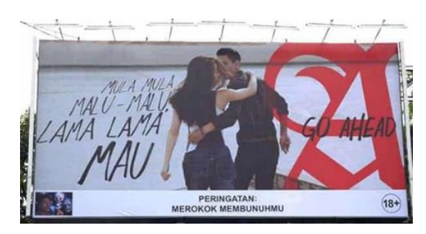
Figure 2. Cigarette

The picture above is one of the cigarette advertisements. Ethical discrepancies that occur are inappropriate, vulgar, or offensive language and images displayed in public spaces. This harms the moral and ethical values of Islam because Islam strictly forbids people who are not muhrim to do things related to shahwat. The martyr turns from truth to immorality, which eventually leads to wickedness and incarceration.<sup>10</sup>