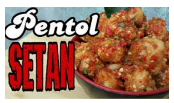
Figure 3. Pentol

The example above is a food advertisement, namely pentol. The discrepancy in advertising ethics that occurs is due to using brand names and slogans that are not good. Something that contains supernatural elements should not be used as a food brand name, because the use of the word is considered inappropriate and like playing with the unseen. The names of food products that contain the names of monks, such as devil noodles, es pocong, kuntilanak chicken, and others, cannot be certified halal by the Indonesian Ulama Council (MUI)<sup>12</sup>.