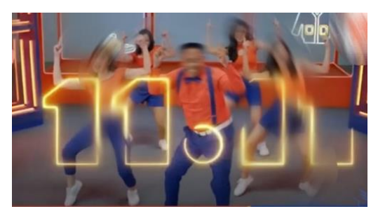
Figure 1. Marketplace

The example above is one of the marketplace ads. The discrepancy in advertising ethics that occurs is for advertising stars or endorsers to wear clothes that show auras. In the Islamic view, all limbs except the hands and face are members of the female aurat, and from the navel to the knees, they are members of the male aurat. And in principle, the aurat should not be shown, because showing the aurat will have a bad effect on him as well as on others.<sup>8</sup>