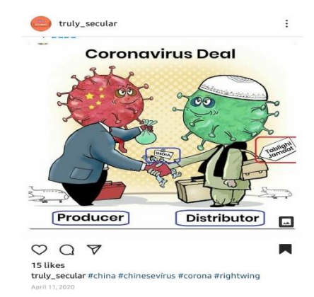
Data 5 . A meme posted by truly_secular that describe Muslim as the spreader of Corona virus

information. Consequently, many people believe that the Muslim community is the only community in India that infects people with Corona virus. This situation could be seen on the below data where an Indian netizen on Instagram, namely truly_secular, posted a content that describe Muslim community as the distributor of Corona virus.