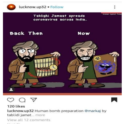
Data 7 : A meme that compares Muslim back then as a terrorist and currently turn to be Corona distributor

The use of social media as an instrument to stigmatize the Muslim community as the distributor of the Corona has been systematically carried out by the Indian online buzzers. they continue to spread negative content and objectify Muslims with stigmatizing terms. If Muslim community, in the past, used to be addressed as a terrorist, in India nowadays, Muslims are identic with Corona virus. This case could be viewed in the bellow data: