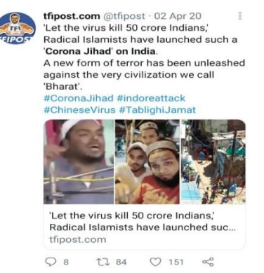
Data 8. This twitter account shows how sensitive this statement to Muslim community.

As for the first account, it states that the Muslim community should be assassinated by the Corona virus itself due to their activity of infecting people with the disease. This racist statement could be seen as follows: