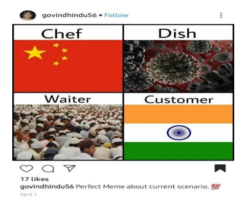
Data 6. a meme posted by govidhindu56 that amplify how Corona virus infects Indian society.

From the picture, we can see that the Chinese are objectified as a chef who cooked the Corona virus as a cuisine. The Muslim community are perceived as waiters, who are serving the Corona virus for Indians. This meme was liked by 17 netizens in April 1, 2020.